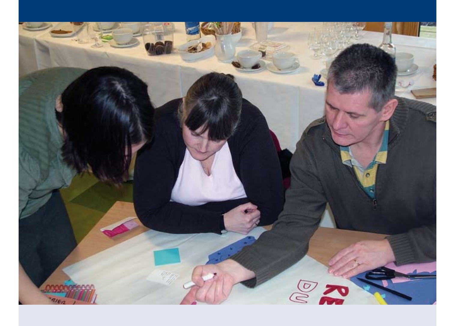
The Project Sites